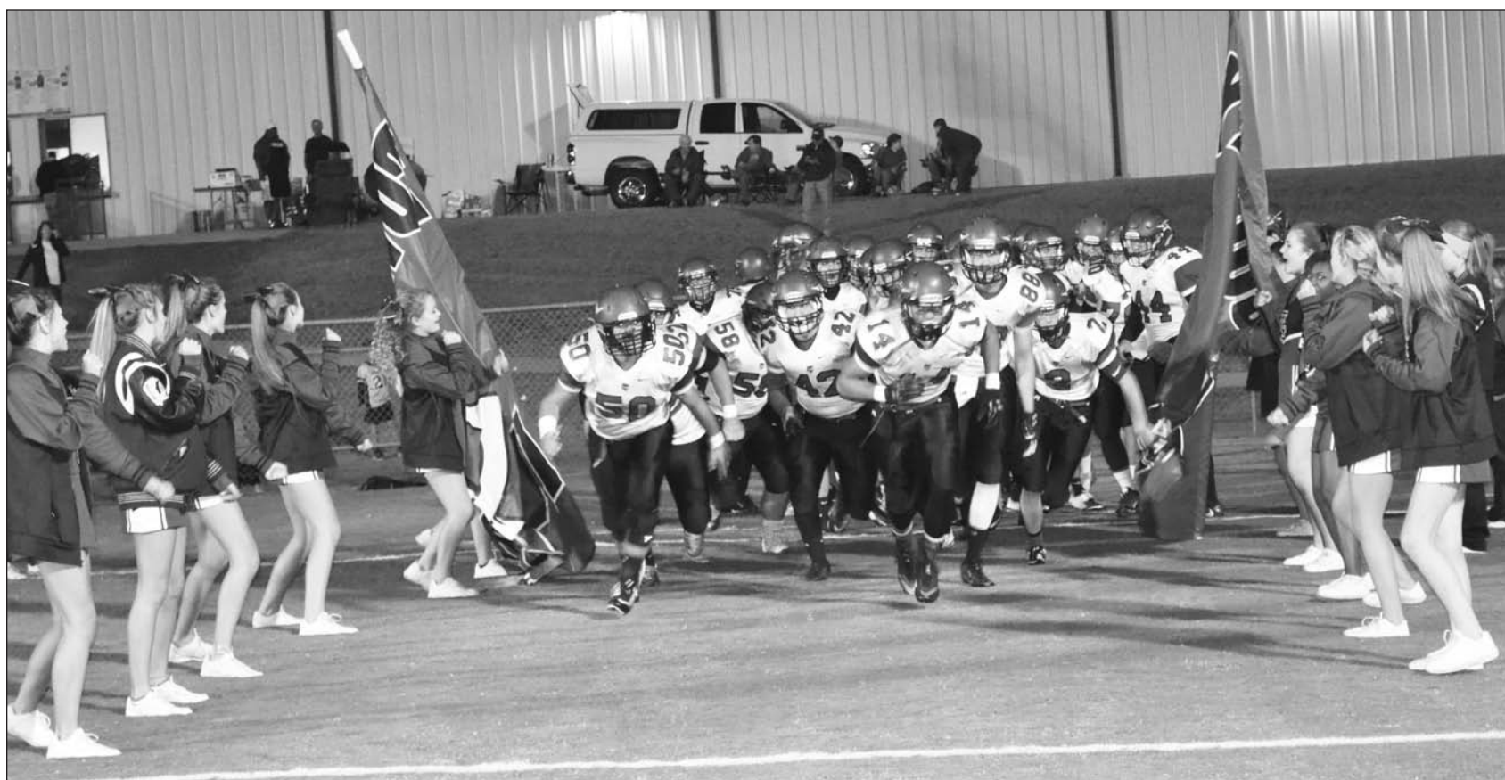
The Towns County Indians storm the field at Commerce where the offense made an immediate impact on the Class A Public 9th ranked Tigers.